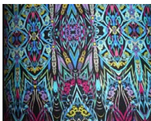
Fusion from Benartex

While I was gone several new lines of fabric came in