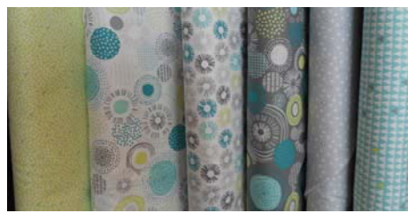
Soho from Northcott